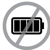
No electricity needed