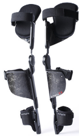
archelis FX stick

Archelis distributes weight evenly across thighs and shins, reducing stress on the soles of your feet by up to 50%. Relieves chronic pain and fatigue caused by prolonged standing.