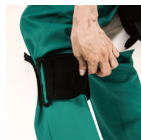
Attach to your shin with belt