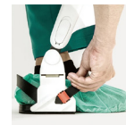
Attach device to foot/ankle and adjust with belt