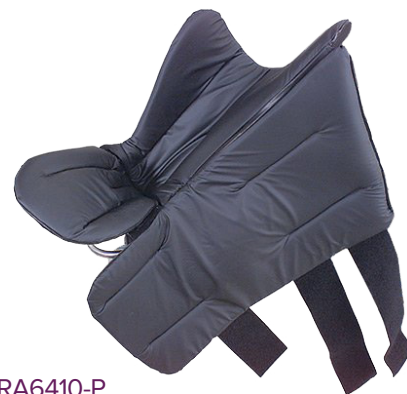
KYRA6410-P Fits Bariatric stirrups