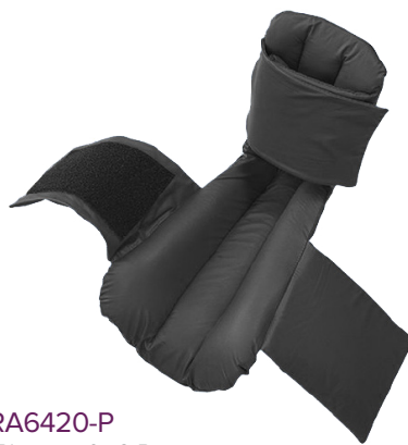
KYRA6420-P Fits Blue non-fin & Basic stirrups