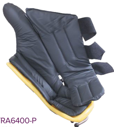
KYRA6400-P Fits Yellow stirrups