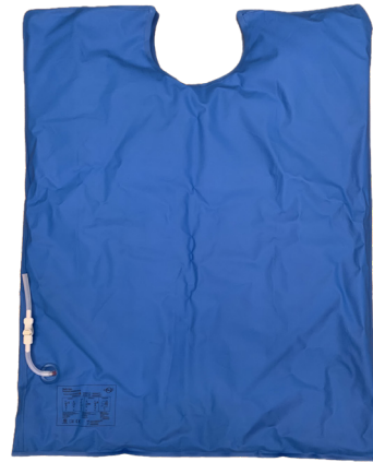
QV30 730mm x 900mm