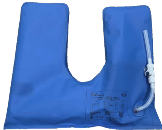
QV11 400mm x 350mm

Quik Vac Bean Bag Positioners are a U shaped positioner and available in Head and Neck plus optional widths to accommodate varying procedures and sizes.