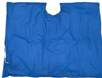
QV32 1200mm x 900mm