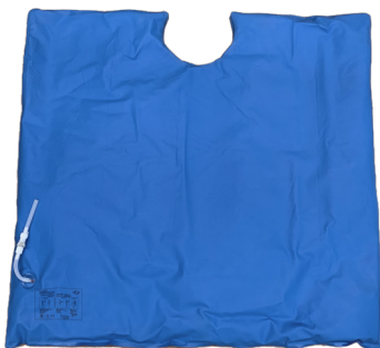
QV31 980mm x 900mm