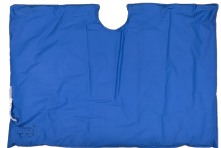
QV33 1360mm x 900mm